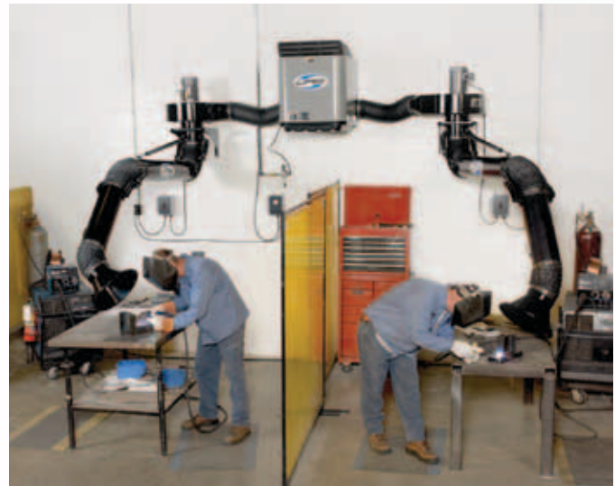
WS-C system shown with one or two extraction arms.