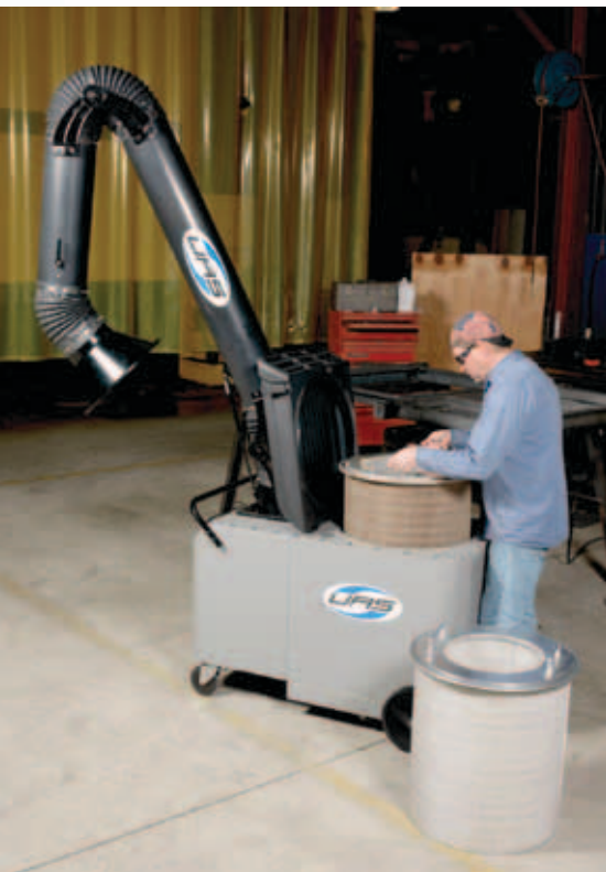
Quick filter change.

Choose on-board cleaning for heavy welding.